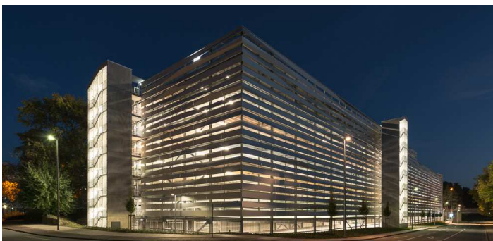
Night view from north-west

Client: BLB Bau- und Liegenschaftsbetrieb NRW