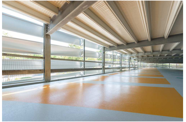
Interior view