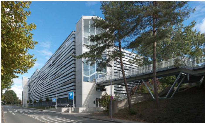
View from south-west