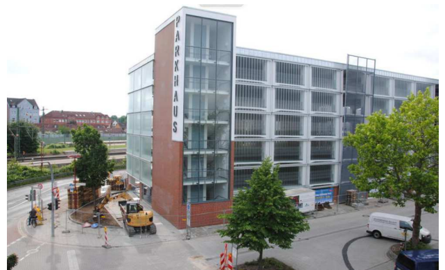
Car park view from the Zuckerpassage

AMP was commissioned to design a user-friendly car park, accommodating current parking bay dimension standards and to produce a structure that would harmonize with the urban fabric. Upon completion of the Façade design, a Planning Application was submitted and tender documentation prepared for the appointment of a general contractor.