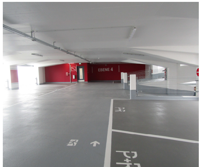
Interior view in parking level 4