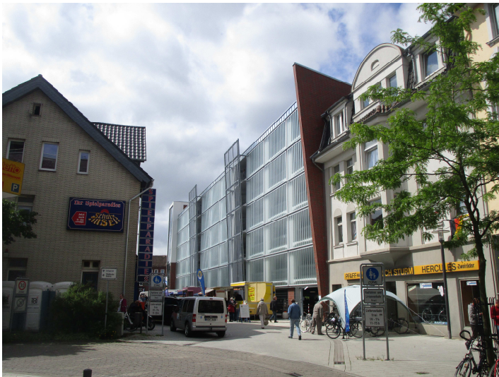
Car park view from the pedestrian zone