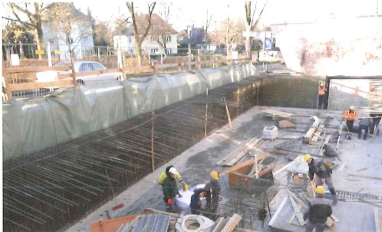
Work on the intermediate ceiling

Körnerstraße 25 : D-76135 Karlsruhe Telefon: 0721 / 985 74 - 0 : Fax: 0721 / 985 74 - 99