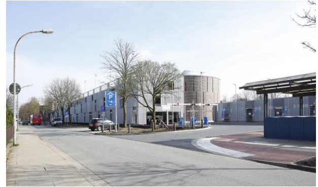
Southwest corner semicircular ingress

The two semicircular ramps have slots within the brick façade to allow light into the ramp area and reflects the local vernacular.