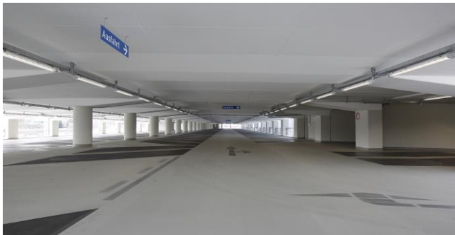
Level 1