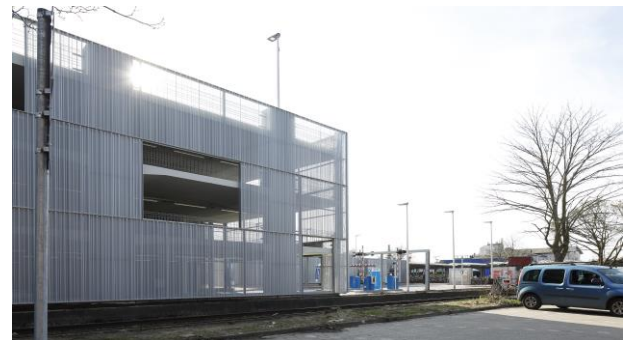
Exterior facade Street side