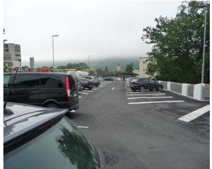
Upper level

AMP was commissioned with all planning services including construction management.