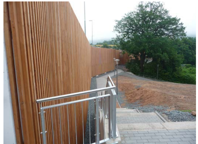
Larch wood facade