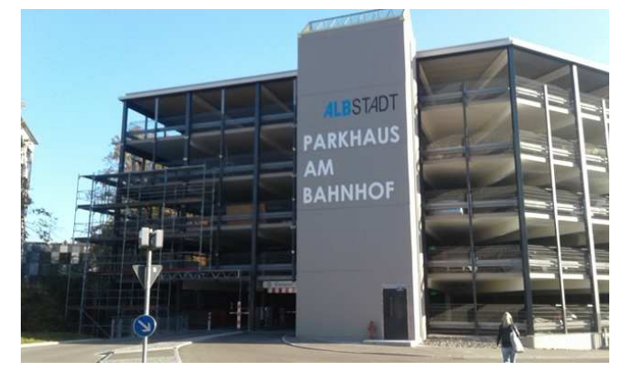
West Elevation, new ingress/egress

The multi-storey car park situated near the main train station in Ebingen was originally built in 1991. The main body of the building compromises of structural steel composite elements and delivers 524 parking spaces.