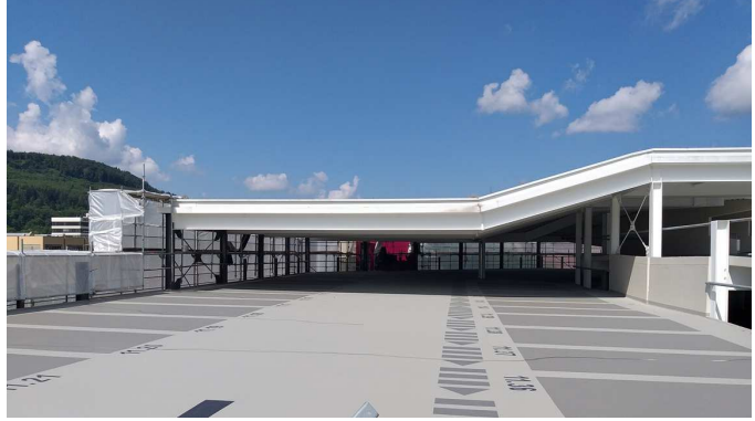
Roof level after restoration

Client: Albstadt Council. Planning services AMP: Inventory, building and drainage planning. Building contractor: BeKor GmbH. Hamburg Car Park information: Number of parking bays: 524 Parking bay width: 2,30 - 2,80 m Angle of parking bays: 90 ° Gross car park area: 13.501 m<sup>2</sup> Net building cost: 2.1 Mio € Opening date: October 2018