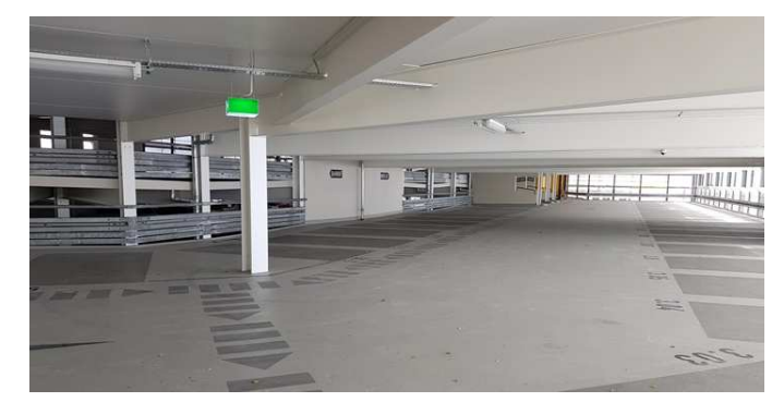
Parking level after restoration