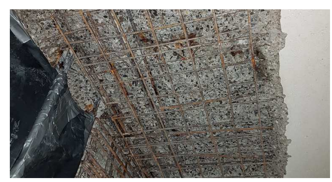
Rehabilitation of a damaged area