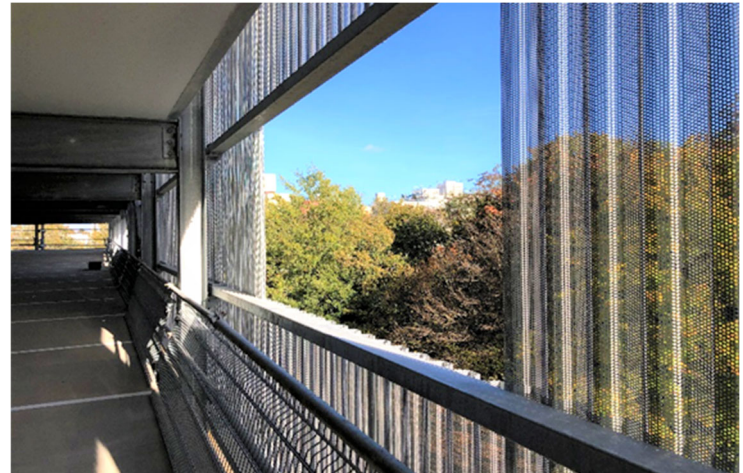
Facade detail