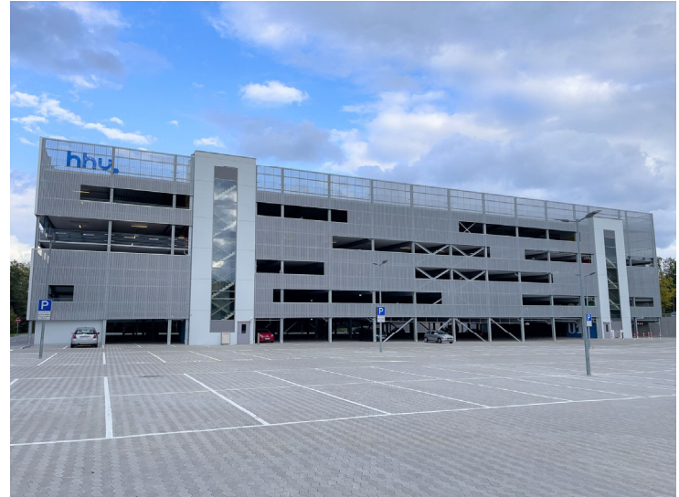
West facade

Thujaweg 1 D - 76149 Karlsruhe Telephone: +49 721 / 98574 - 0 Fax: +49 721 / 98574 - 99 Mail: info@amp-parking.com Internet: www.amp-parking.com