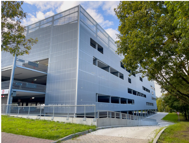
East facade