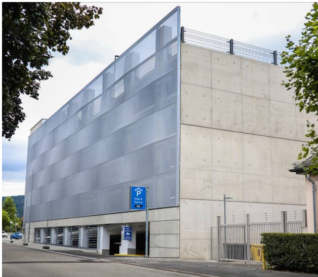
Southwest Elevation

As usual with AMP garages, traffic moves in one-way traffic. The parking spaces are 2.50 m wide and placed at a user-friendly angle.