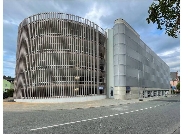
Southeast Elevation