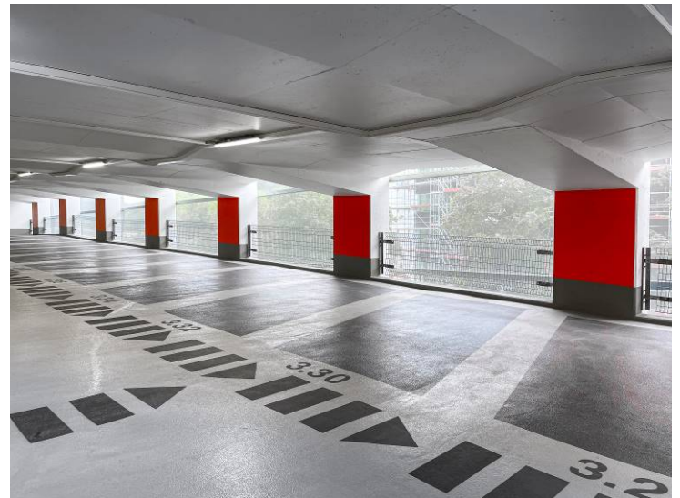
Parking level