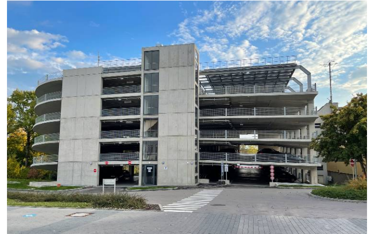
North Elevation