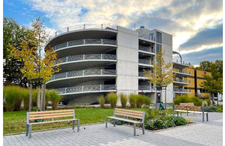
View of Car Park

On the roof there is a photovoltaic system with an output of 98 KW, allowing a total of 8 charging points for electric vehicles.