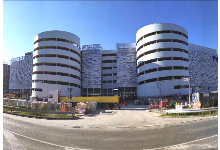
North Elevation