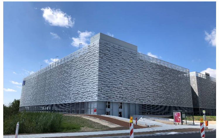
Northwest Elevation