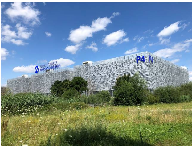
Southwest Elevation