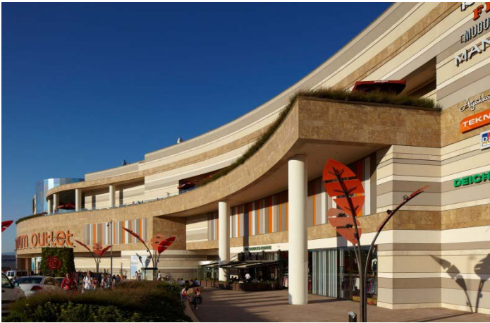
Entrance area of the Outlet Centre