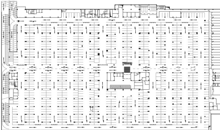
Floor plan of 1 st basement