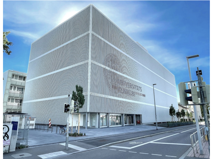
Externail Facade

As general planner, AMP was commissioned with the optimization of an existing design, together with the planning submission, tender submission and site supervision.