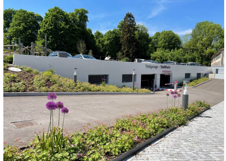
Entrance to underground garage

The parking level consists of two traffic aisles, on which the 2.60 m wide parking spaces are arranged diagonally on both sides of the aisles for convenient accessibility.