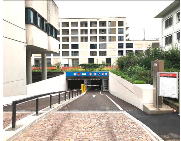
Entrance to underground parking

Telephone: +49 721 / 98574 - 0 Fax: +49 721 / 98574 - 99 Mail: info@amp-parking.com Internet: www.amp-parking.com