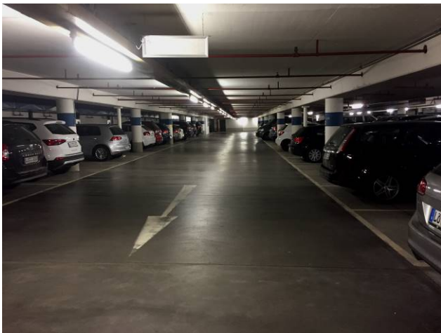
Car Park before renovation

AMP was commissioned with building planning.