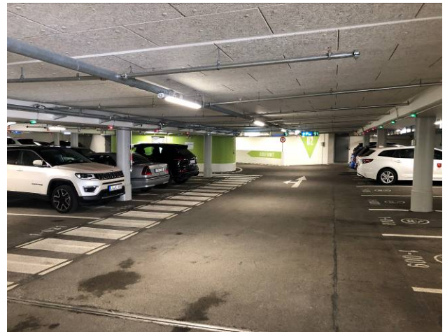
Car Park after renovation