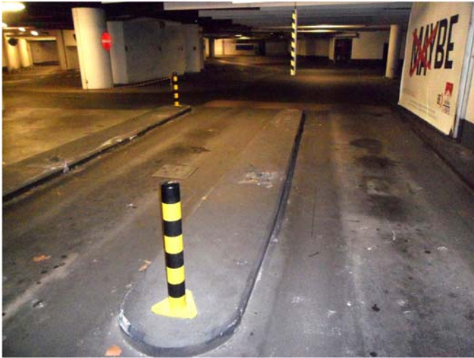
Entrance 1st basement before the renovation