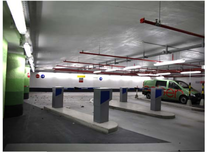
Exit 1st Basement after the renovation