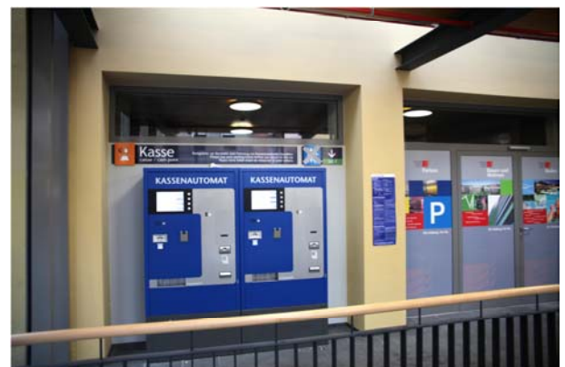
Ticket machines on the ground floor after renovation