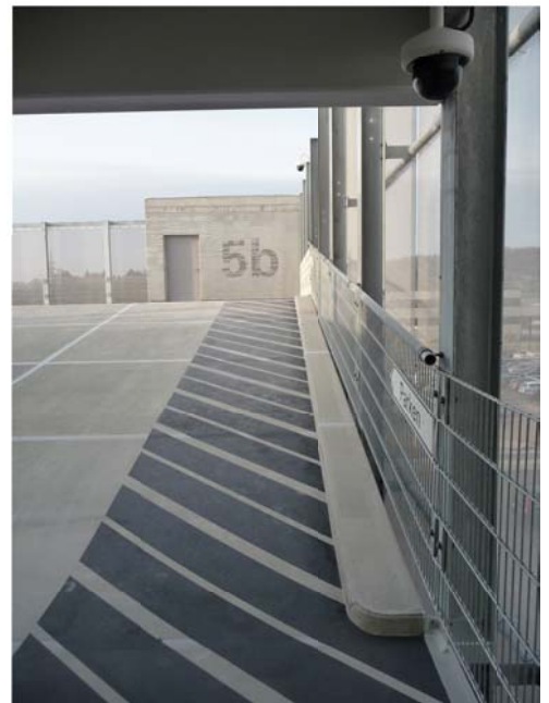
Staircase Level 5