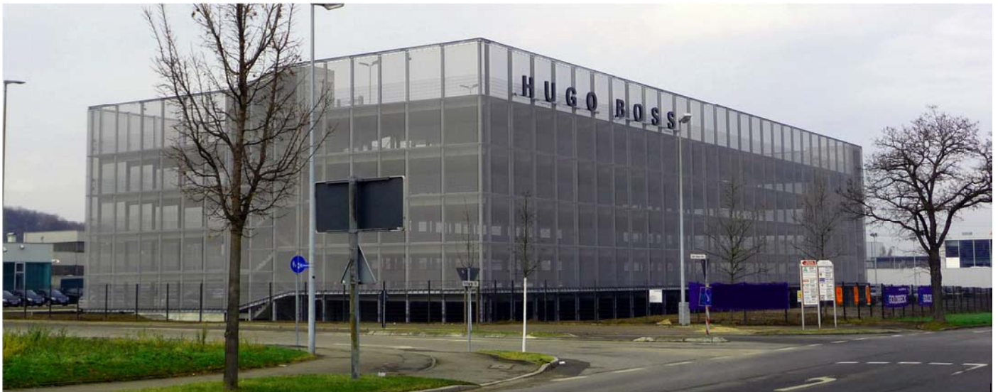
View from the southeast